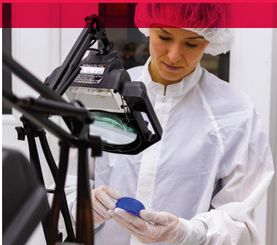
Class 10,000 (7) Clean Room

Today's advanced medical procedures and treatments have placed rigorous new requirements on medical equipment and devices. Seals and other parts in medical products are now exposed to a wider range of chemical and temperature environments than ever before. Furthermore, the move towards smaller devices has driven down the size of components, including seals. With silicone parts and seals from Apple Rubber you're ensured a robust and high-quality final product.