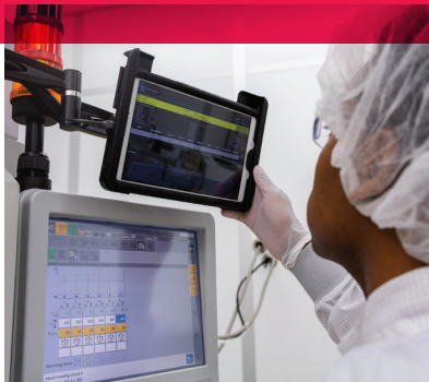
Full quality-control processing